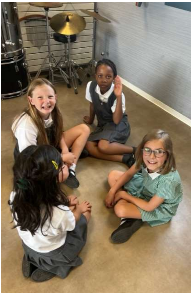
Grade 5 enjoying their first P.E lesson, learning the skills of Netball.