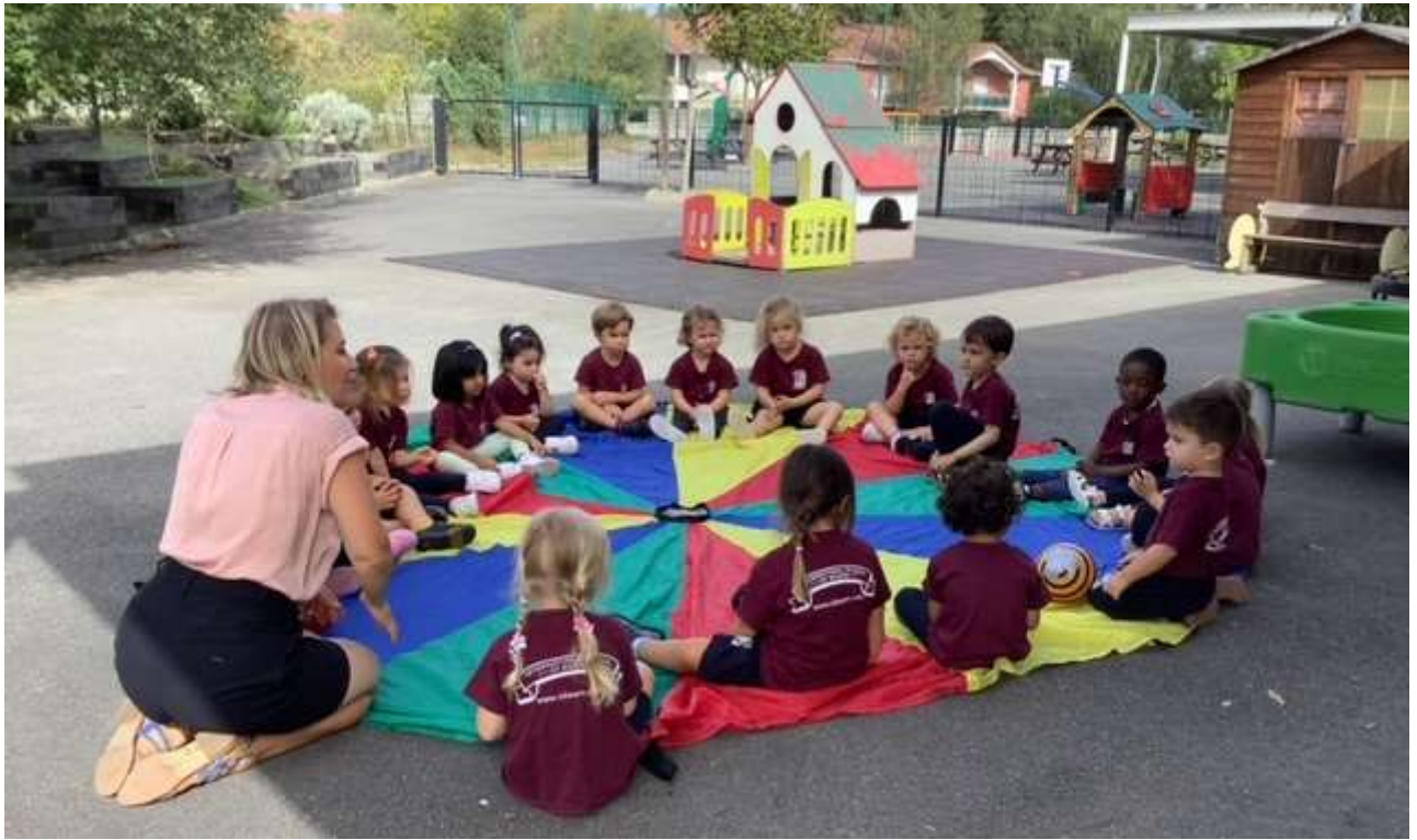
What a wonderful start in Reception - settling into new routines, making new friends, exploring our new classroom, working together and having fun!