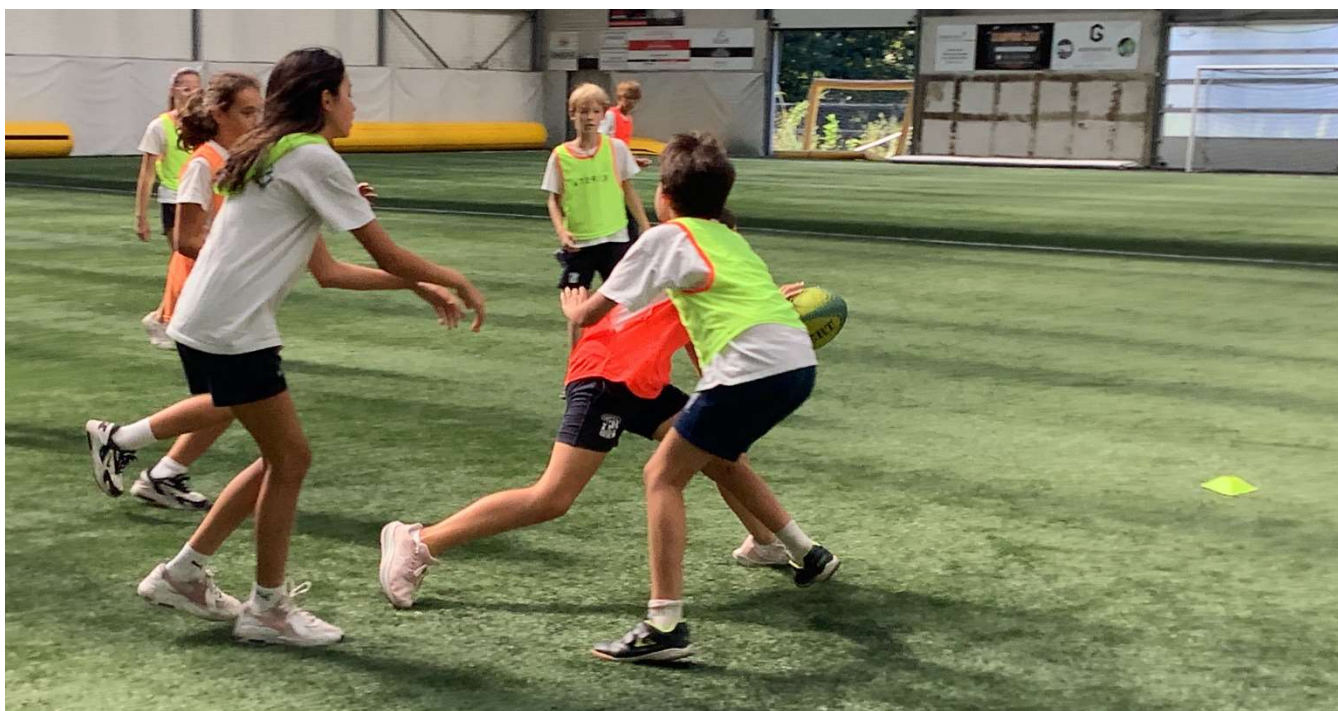
Grades 7 and 8 playing rugby during their PE session