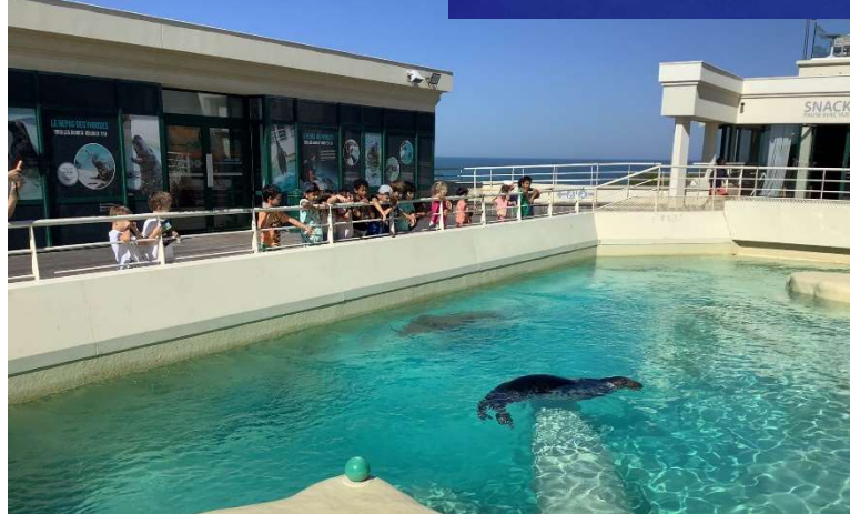
Grades 4, 5 and 6 went in a 3 days surf trip in Seignosse (Cap Océan)