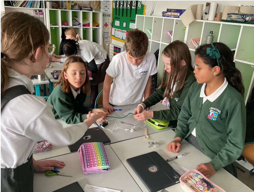
Grade 6 investigate electrical circuits during a Science lesson

The school cannot accept responsibility for toys that are lost or damaged.