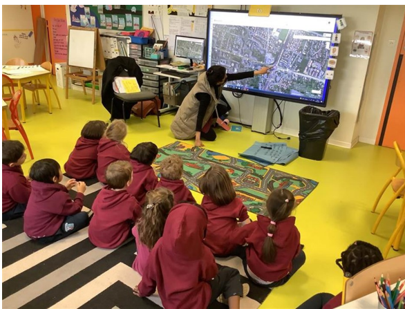
Reception Class discover and explore maps, using Google Earth, as a part of their 'Journeys' topic