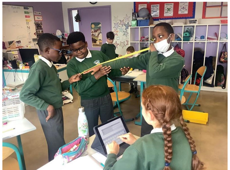
Grade 6 investigate the mean-average during a Maths lesson